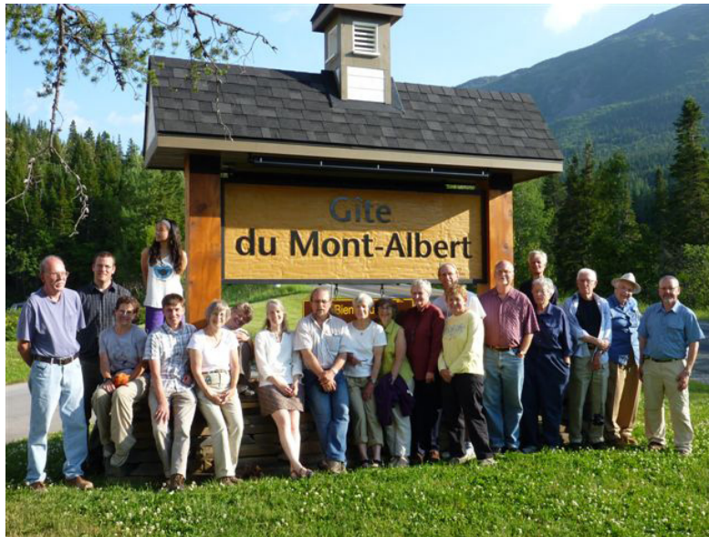
Crum Workshop, Parc de la Gaspésie, 2-5 July 2013

Société québécoise de bryologie, 2018. Bryophytes collected during the July 2013 Crum Workshop (including data from the 2012 Tuckermann Workshop), Parc national de la Gaspésie, Québec, Canada – Lepagea no. 24, 7 pages. [Version dated 2018-02-24].